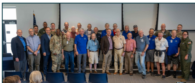
Above: Nevada National Guard Leadership and other community members pose with the Misty FACs.