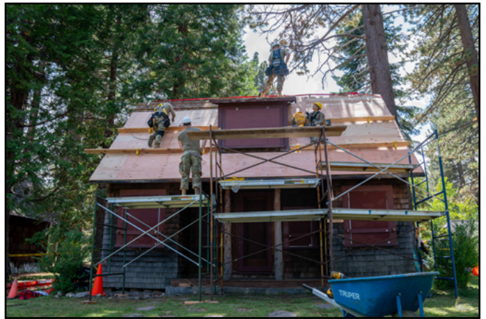
U.S. Air Force Airmen from the 152nd Civil Engineer Squadron work to restore a shake roof on a cabin at Tallac Historic Site, South Lake Tahoe, Calif., September 11, 2023. The 152nd Civil Engineer Squadron has been working on historical restoration construction projects at Tallac Historic Site since 1983.