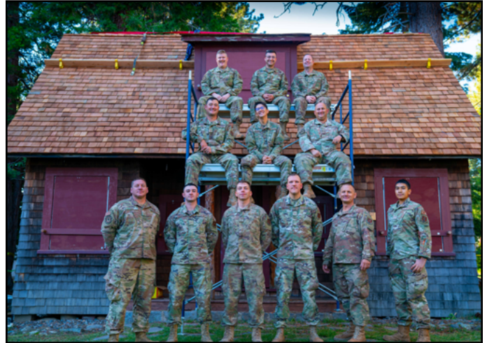
Airmen from the 152nd Civil Engineer Squadron, Nevada Air National Guard, pose for a group photo in front of the shake roof at Tallac Historic Site, South Lake Tahoe, Calif., September 15, 2023. The 152nd Civil Engineer Squadron has been working on historical restoration construction projects at Tallac Historic Site since 1983.

"I was working at the site on 9/11 and everything was very still and quiet in Tahoe. I looked out over the lake and saw fighter aircraft fly