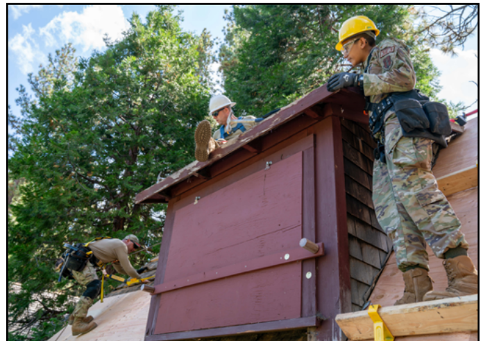
U.S. Air Force Airmen from the 152nd Civil Engineer Squadron work to restore a shake roof on a cabin at Tallac Historic Site, South Lake Tahoe, Calif., September 11, 2023. The 152nd Civil Engineer Squadron has been working on historical restoration construction projects at Tallac Historic Site since 1983.